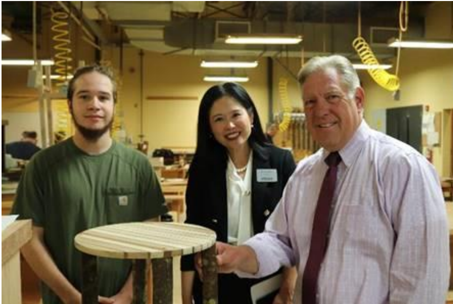
First lady Dr. Jill Biden visits programs, learns about Technical High School