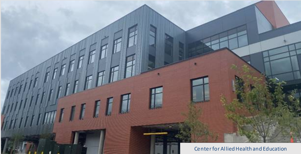
Center for Allied Health and Education